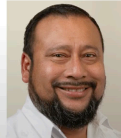
Mr. Jose Mai Minister of Agriculture, Food Security & Enterprise, Belize